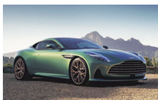
British luxury sports car manufacturer Aston Martin also revealed its plans last year to open a new dealership in South India, aiming to double its Indian market sales

"Southern states have been increasingly growing in their contribution to national sales for both our TEV (top-end vehicle) and BEV (battery EV) portfolios. Among southern metros, Hyderabad, in particular, has witnessed strong demand for the TEV segment, and we have inaugurated India's first Maybach Lounge. Even for BEV sales penetration, southern states lead in BEV transition, with 8 per cent penetration in total sales, which is higher than the national BEV penetration. States like Telangana and Kerala, in particular, have spearheaded BEV adoption with favourable government policies offering incentives to